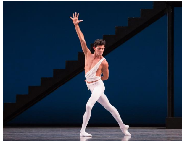
Left: New World Symphony, conducted by Michael Tilson Thomas. Right: Miami City Ballet performance.

MIAMI BEACH, FLORIDA (November 25, 2019) — On Saturday, February 1, at 7:30 p.m. ET, the New World Symphony, America's Orchestral Academy (NWS), and Miami City Ballet (MCB) come together for a special live-streamed WALLCAST® event celebrating Igor Stravinsky and George Balanchine, two icons of the 20 th century whose decades-long friendship proved to be one of the most prolific artistic pairings of their time. Led by NWS Co-Founder and Artistic Director Michael Tilson Thomas (MTT), this performance at the New World Center is projected live on the 7,000-sq.-ft. eastern façade of the building and may be experienced for free in adjacent SoundScape Park. Additionally, a free live-stream is available to viewers around the world via Medici.tv .