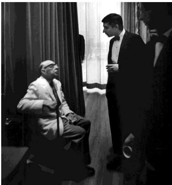
Left: Michael Tilson Thomas with Igor Stravinsky.